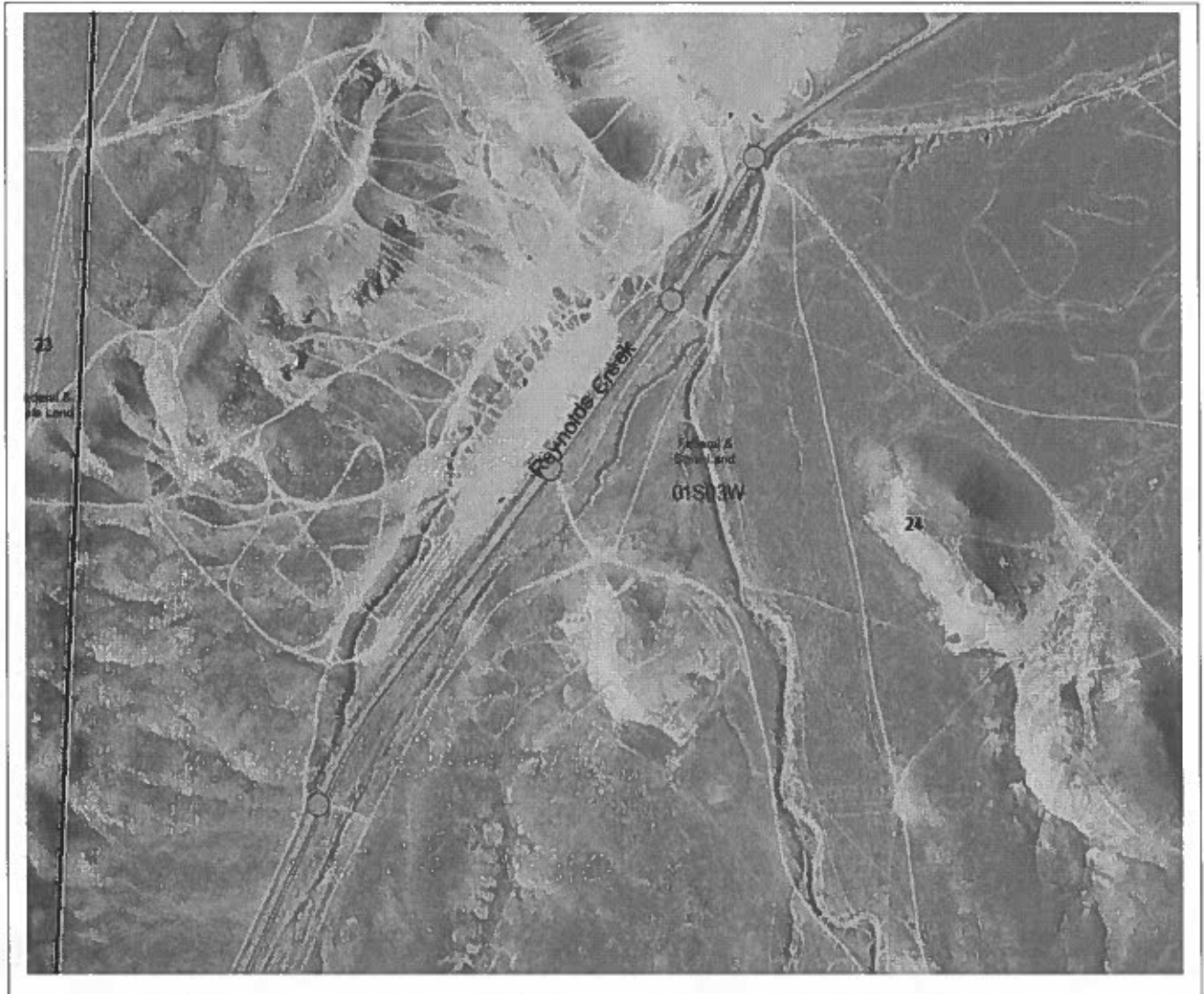
EXHIBIT A Green circles indicate designated crossing points.