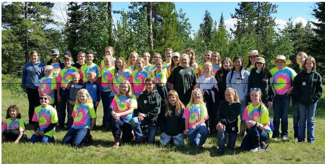
Participants at the 2016 District II Horse Camp